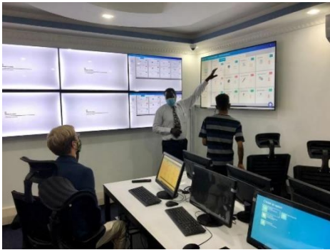
Control room at WRA headquarters for WRA's Smart Metering Project