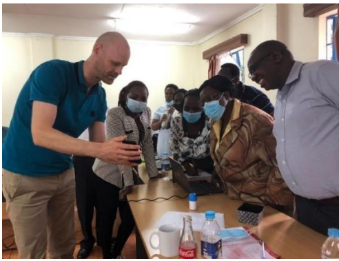
DWA demonstrating the mobile water monitoring app