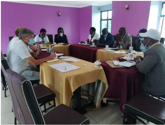
Meeting with Upper Thika and Thika Mid WRUA's