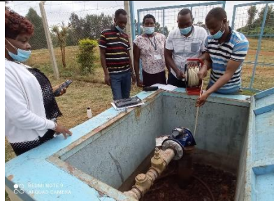
Raw water master meters