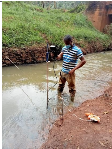
Measuring of surface water discharge