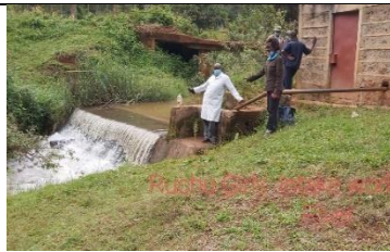
Surface water Intake at Ruchu Girls School