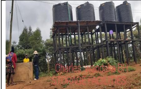
Borehole water storage facilities