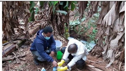
The team labelling water samples collected